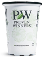
4.25 Grande™ Co-Ex* 10-count tray