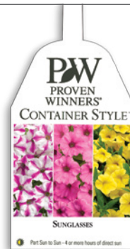
Combination-Specific Container Style Tag