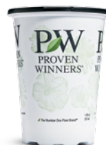
4.25 Grande™ Co-Ex