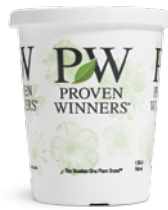
Grande™ or larger