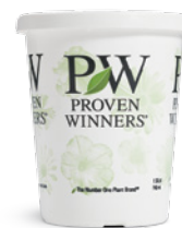
Grande™ or larger

See the complete selection of branded container styles on page 220.