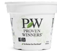
4.5 Classic™** 8-count tray