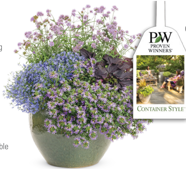
Container Style Tag