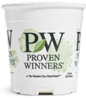
1.0 QT* Co-Ex available* 8-count tray