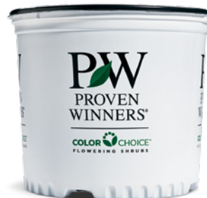
Premium 3 Gallon