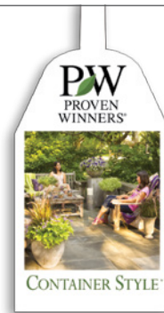
Container Style Tag