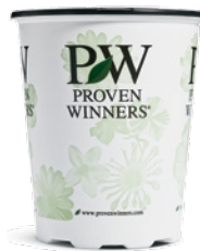
1.0 GL Royale™ Co-Ex* 3-count tray