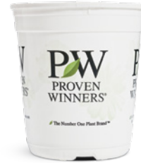
1.0 GL Royale™** 3-count tray