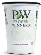
4.25 Grande™ Co-Ex