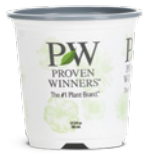
3.5 Accents Co-Ex 12-count tray