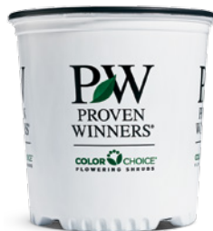
Premium 2 Gallon