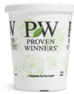
4.25 Grande™** 10-count tray