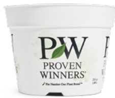
6.50* Co-Ex available* 6-count tray