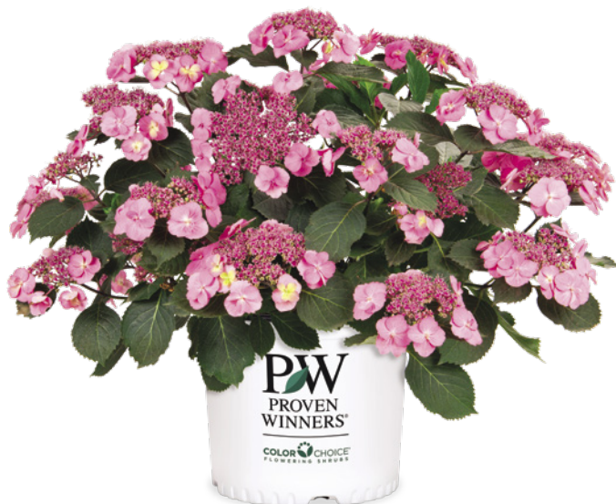
Premium 1 Gallon