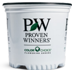
Premium 1 Gallon